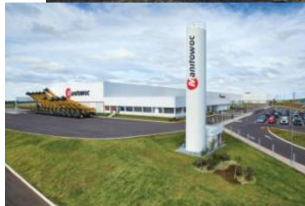
Passo Fundo, Brazil